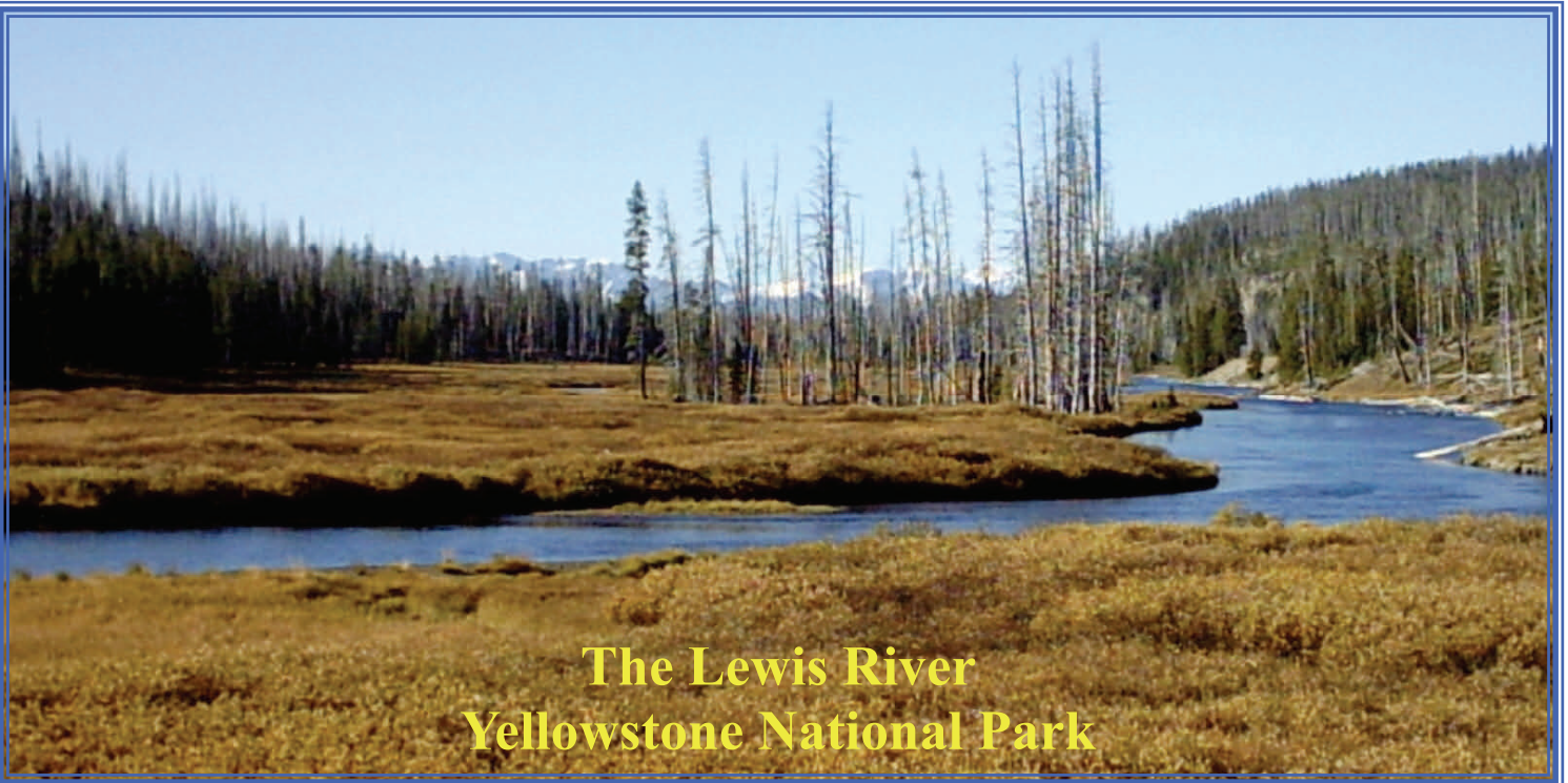
The Lewis River Yellowstone National Park